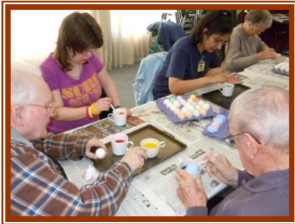
Easter Egg Fun with Students