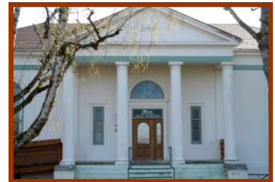
Davis Hall Before and After

the next 10 years finds TRH stronger financially, even more relevant in the Christian retirement community and looking forward to many more years of quality service to our Christian friends and families.