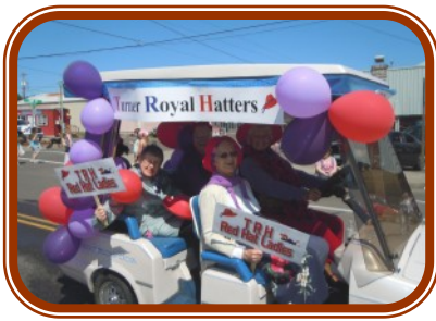
Lamb Festival Parade June 4th