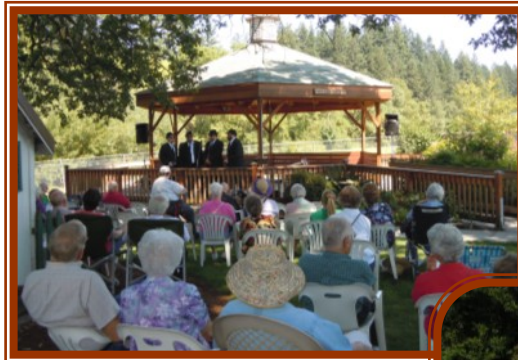
Summer Concert in Gary Johnson Park and a trip to Week of Missions at Winema Christian Camp