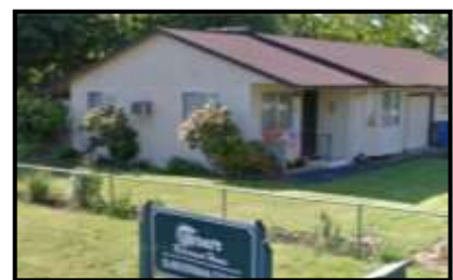
Independent housing in the Eden Circle & Mill Creek Court, Gunderman Court and the Hill Top neighborhoods.