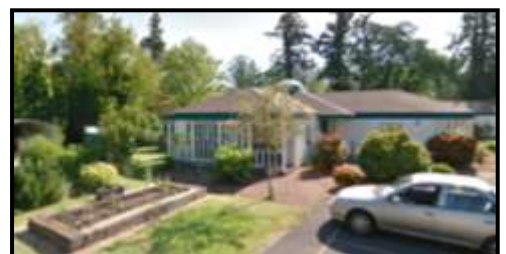
Main campus area and the Residential Care Facility (octaplex)